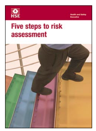
This is a web-friendly version of leaflet INDG163(rev3), revised 06/11